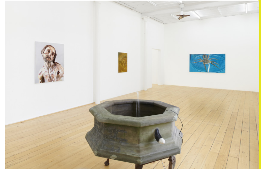
Hamishi Farah, Exhibition view, Dog Heaven 2 : How Sweet the Wound of Jesus Tastes , Fri Art, 2021.