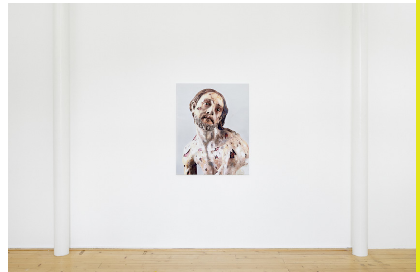
Hamishi Farah, Ostentation Vulnerum , 2021, Fri Art, 2021.