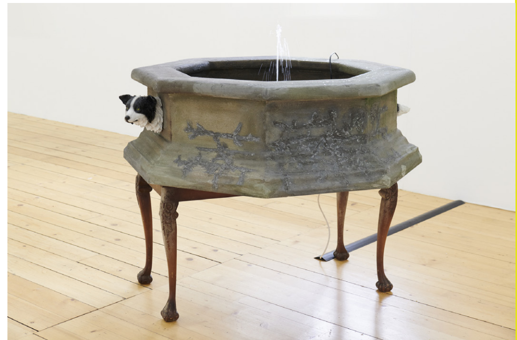
Hamishi Farah, Dog Heaven , 2015, Fri Art, 2021.

Dog Heaven (2015) is a sculpture made of a table, a fountain, a pump. The fountain has a dog's head affixed to one side, its tail on the opposite side. The work made on the occasion of the artists' first exhibition in Europe in 2015 returns and gives its title to the exhibition. It is a tribute to the first dog to survive a shipwreck and become the first canine migrant. The sculpture is accompanied by a retroactive application for the importation of pets installed in a molding on the wall.