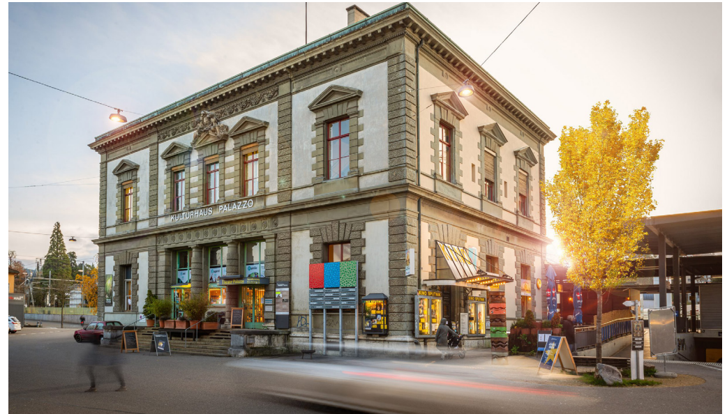
Kunsthalle Palazzo, 2019

Founded in 1979, the Kunsthalle Palazzo is a venue for contemporary art. It hosts three rotating exhibitions each year, featuring artists with regional, national, and international orientations. The six exhibition spaces of varying sizes provide a dynamic and diverse tour experience. A rich educational program, including guided tours, workshops, artist talks, and family afternoons, accompanies the exhibitions and invites visitors to engage with the artworks.