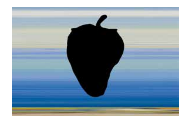
Denis Savary Corinna, 2021 Print on wallpaper, dimensions variable

Views of the exhibition to download: 17 June 2021, 10 am.