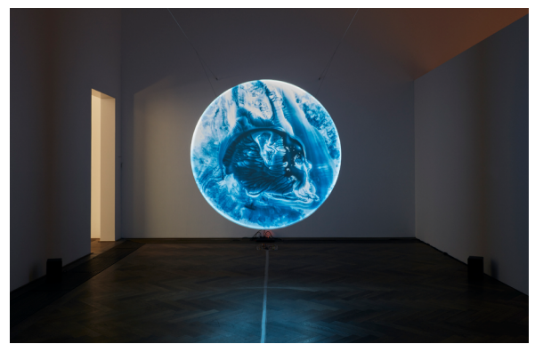
Franziska Baumgartner, Tidal, 2020, Installation view Kunsthalle Basel, 2021, Photo: Moritz Schermbach.