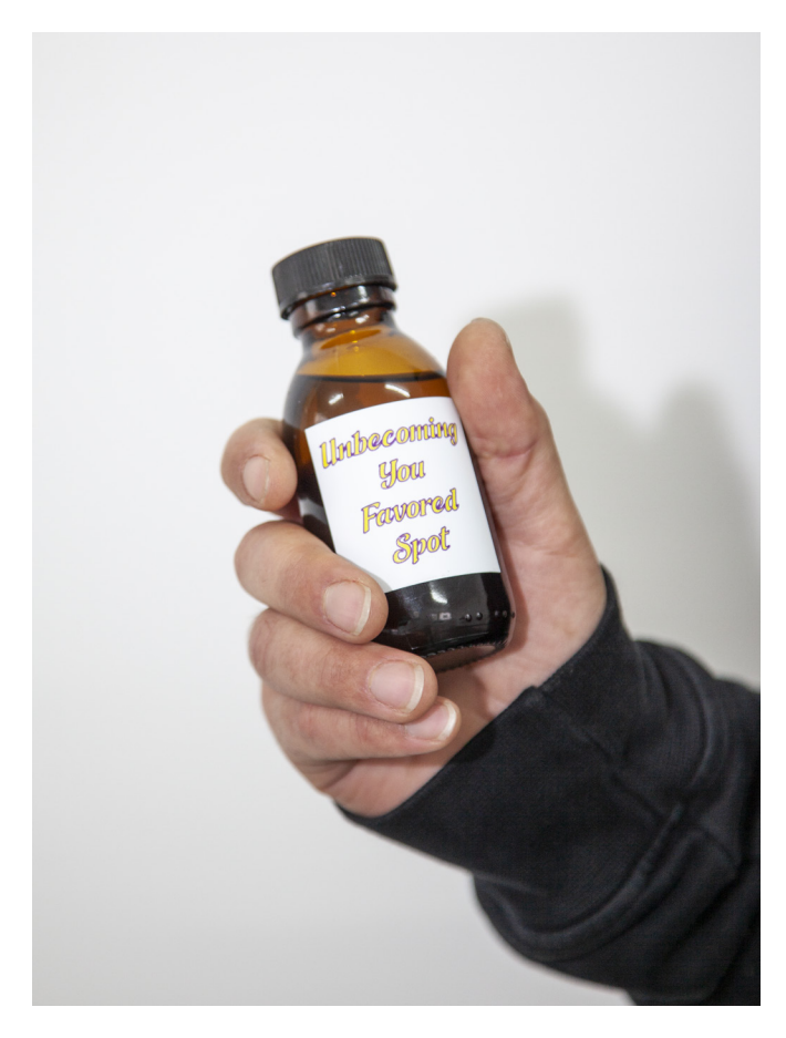
Unbecoming you favored spot Chemical essences of beaver, owl, cortex, leather