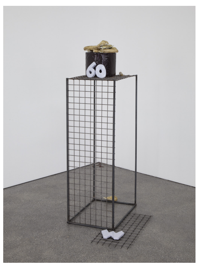
Treat #1, Monroe Carboard covered with plaster, plaster, grid, iron structure