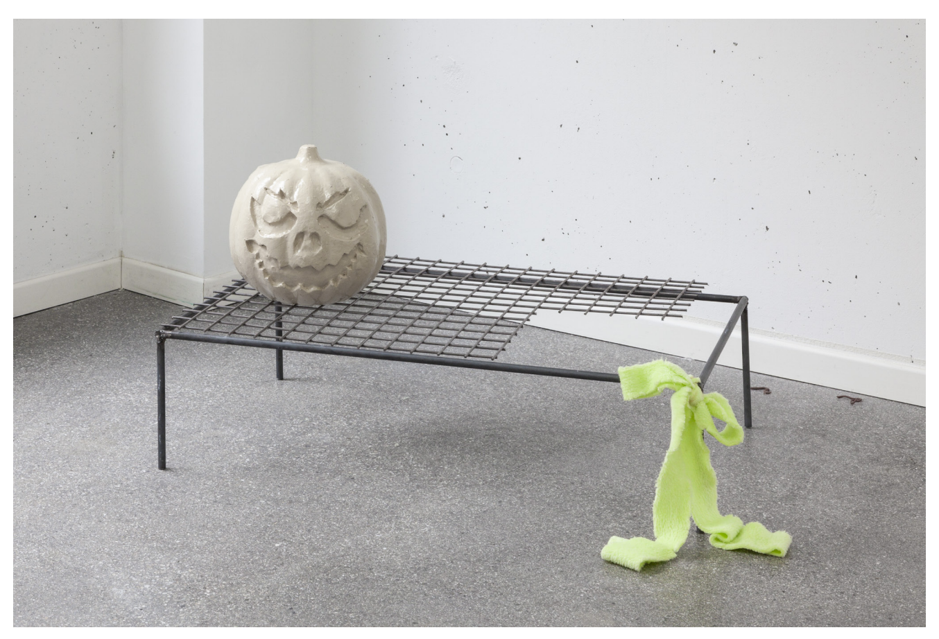
Treat #5, Boo! Papier mâché, fleece, grid, iron structure