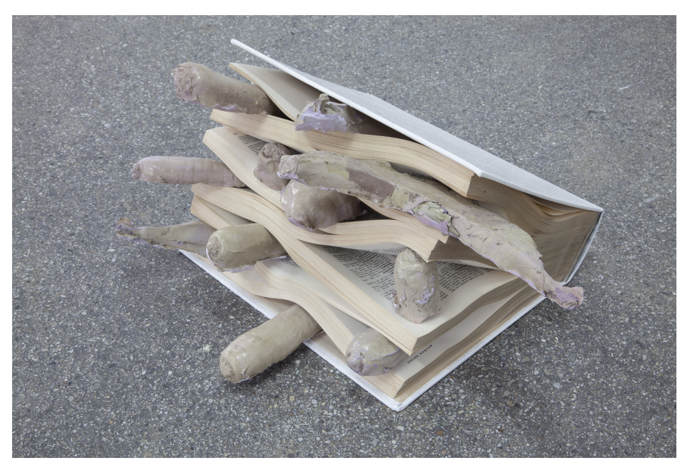
Treat #3, Playtime Book, clay, plaster