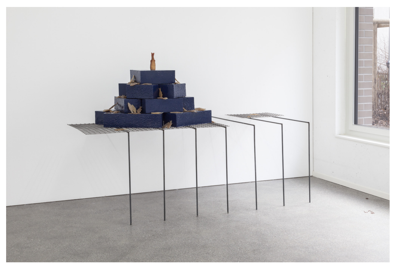
Treat #4, Gus Styrofoam covered with plaster, silicone, latex, grid, iron structure